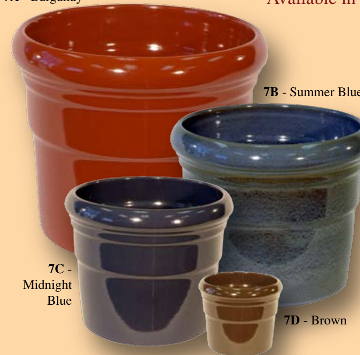
7D - Brown