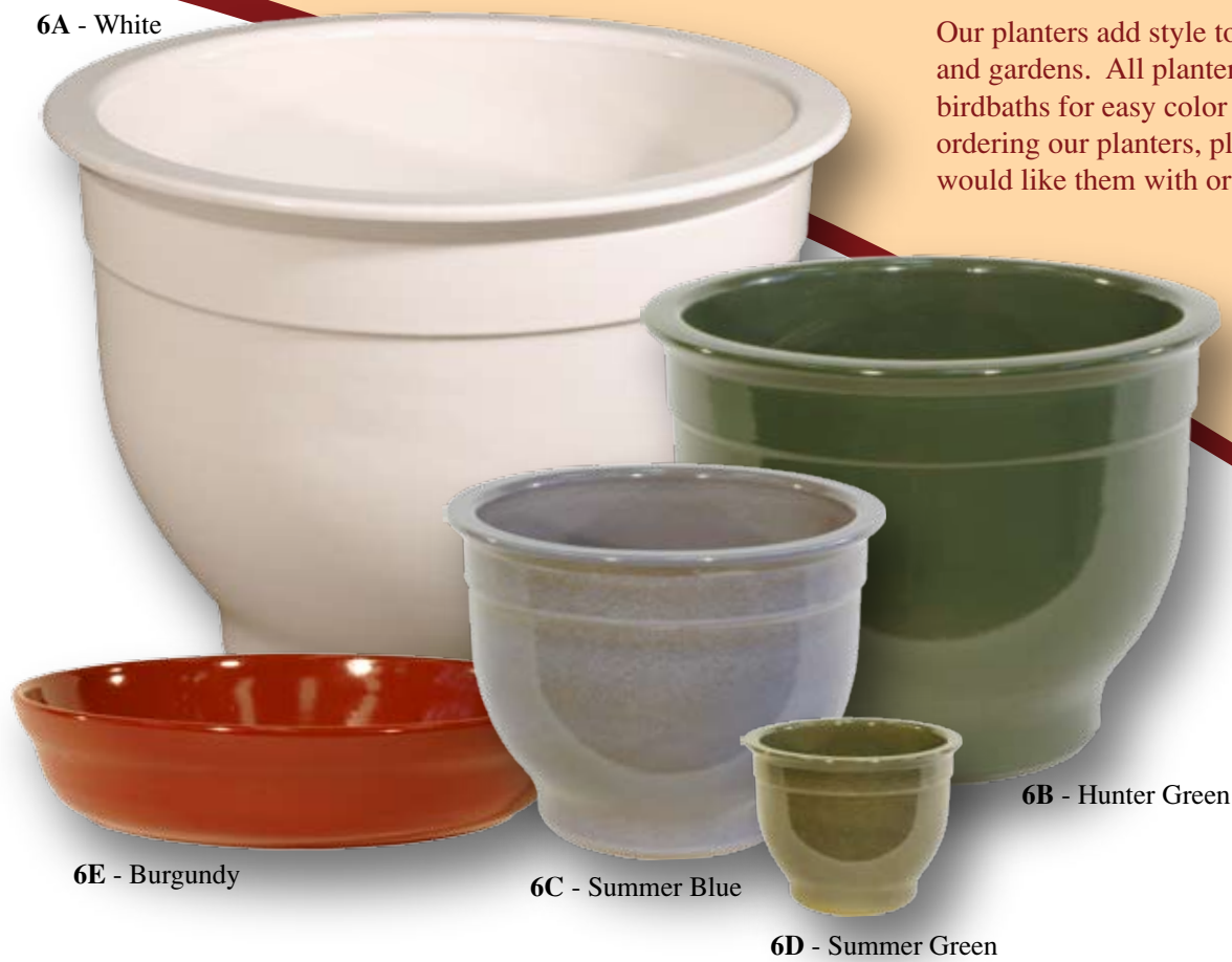
6A - White

Our planters add style to many homes, offices, and gardens. All planter colors match our birdbaths for easy color coordination. When ordering our planters, please specify if you would like them with or without holes.