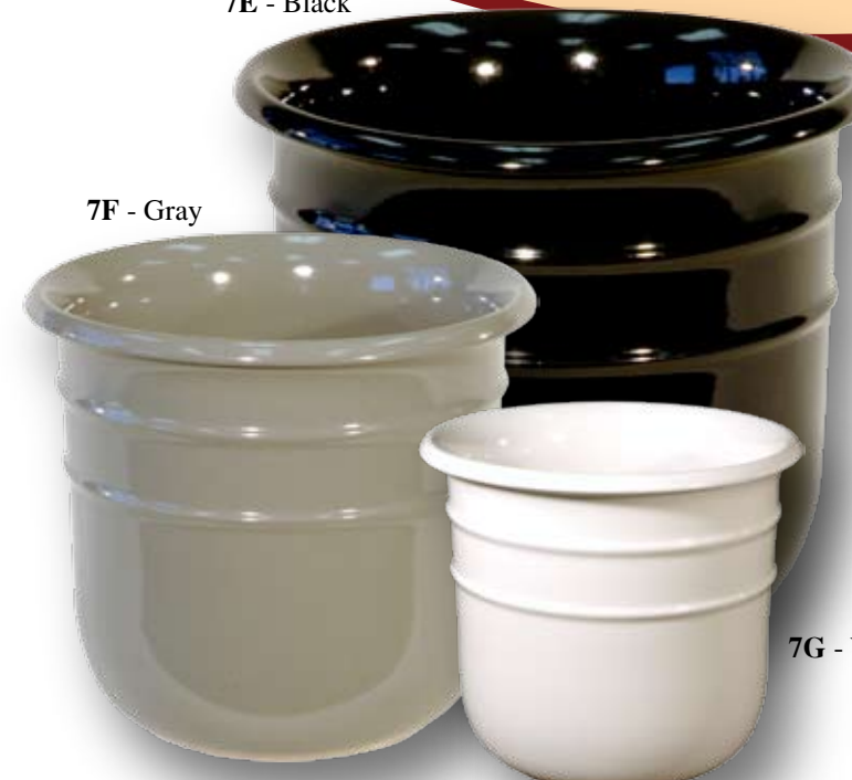
7G - White